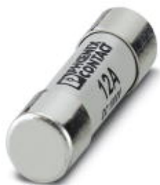
Fuse, 10.3x38 mm, up to 1000 V DC, gPV characteristics

Please be informed that the data shown in this PDF Document is generated from our Online Catalog. Please find the complete data in the user's documentation. Our General Terms of Use for Downloads are valid ( http://phoenixcontact.com/download )