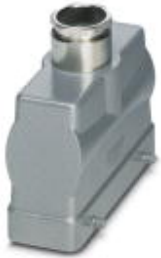
HEAVYCON B24 sleeve housing, for double locking latch, height: 76 mm, with 1 x M32 screw connection, straight cable outlet

Please be informed that the data shown in this PDF Document is generated from our Online Catalog. Please find the complete data in the user's documentation. Our General Terms of Use for Downloads are valid ( http://download.phoenixcontact.com )